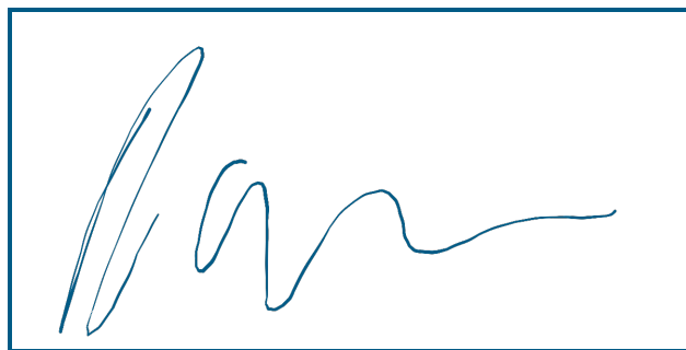
Butler Coring, Inc. GPR Report Agreement